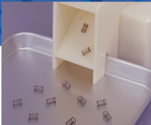
The entangled coil spring is automatically unraveled.